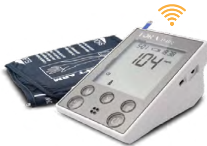
Built-in Cellular Connectivity