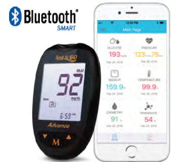
Bluetooth + Smartphone App

FORA's HIPAA-compliant 24/7 HealthView System supports various measurement data uploads which include: blood glucose, blood pressure, temperature, blood oxygen and weight control. Patients' test results are sent via cellular connection, gateway or mobile app to the 24/7 HealthView cloud.