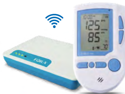
Bluetooth + Cellular Gateway